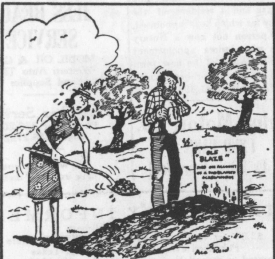
"IF YOU'D KEPT ALERT FER SCREWWORMS LIKE THEM SCIENTIST FELLERS SAID, OLE BLAZE WOULD STILL BE ALIVE!"