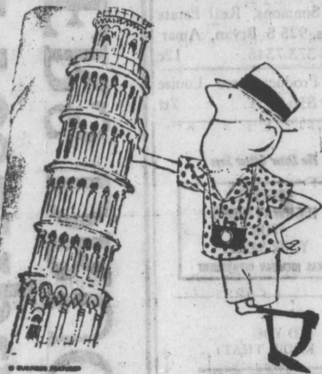
Lean on us for a vacation loan.

NOTICE—Any erroneous reflection upon the character, standing or reputation of any person, firm or corporation which may appear in the columns of The Informer will gladly be corrected upon its being brought to the attention of the publisher.