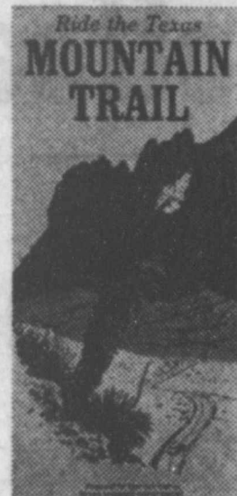
On the Mountain Trail you can see a county bigger than Connecticut.