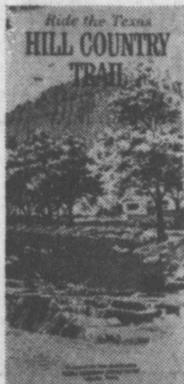
Take the Hill Country Trail and find out whose hair is mohair.