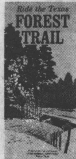
On the Forest Trail you can take the shortest railroad ride in the country.