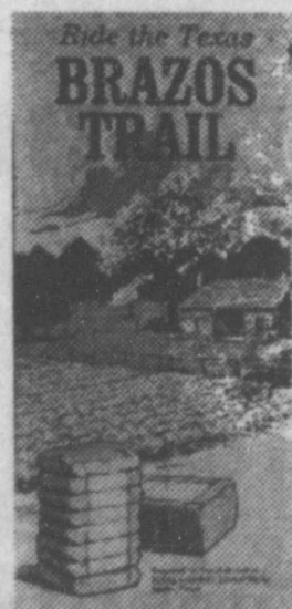
The Brazos Trail tells you where to take Sunday afternoon rides in a surrey.