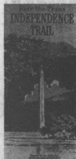
On the Independence Trail you'll see the only oceanarium between the Pacific and the Atlantic.