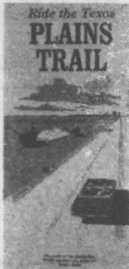
Take the Plains Trail and you'll see a canyon over 100 miles long.

Trail folders. These folders include detailed maps prepared by the Texas Highway Department and descriptive notes on things and places you never knew existed in Texas! land of contrast.