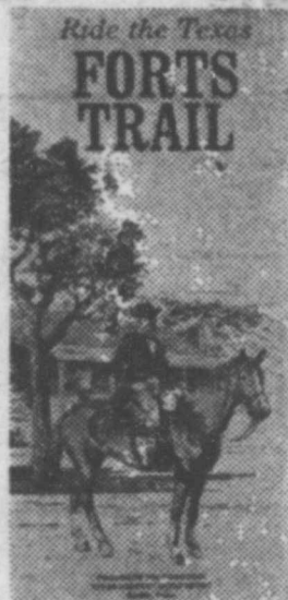
Follow the Forts Trail and you can dine at a restaurant that serves buffalo steaks.