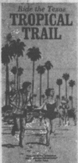
Take the Tropical Trail and maybe you'll catch a glimpse of the near-extinct whooping crane.