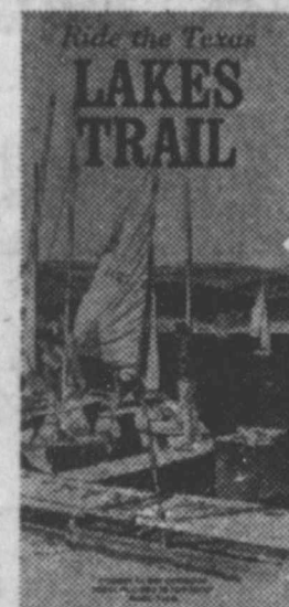
Follow the Lakes Trail and discover what "First Mondays" are and what you can swap there.