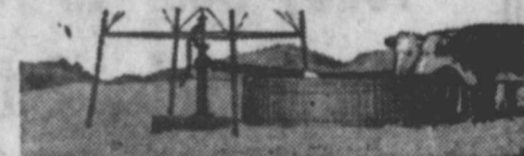
DEMPSTER Water Systems SALES & SERVICE

A superior type of internal brake assures safety in high winds and storms. Windmill sizes from 6' to 14' to meet all your requirements. We have towers, cylinders and all pump accessories, too.