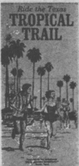
Take the Tropical Trail and maybe you'll catch a glimpse of the near-extinct whooping crane.