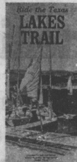
Follow the Lakes Trail and discover what "First Mondays" are and what you can swap there.