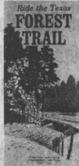
On the Forest Trail you can take the shortest railroad ride in the country.