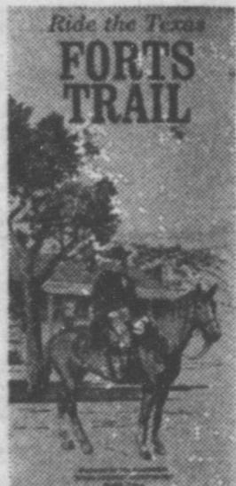
Follow the Forts Trail and you can dine at a restaurant that serves buffalo steaks.