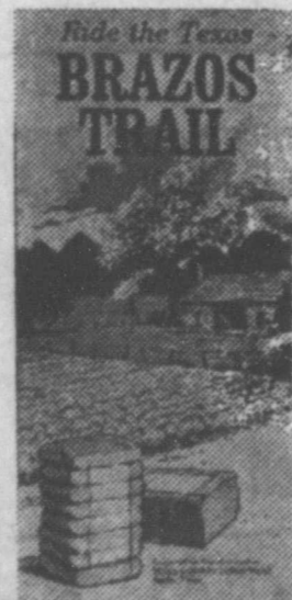
The Brazos Trail tells you where to take Sunday afternoon rides in a surrey.