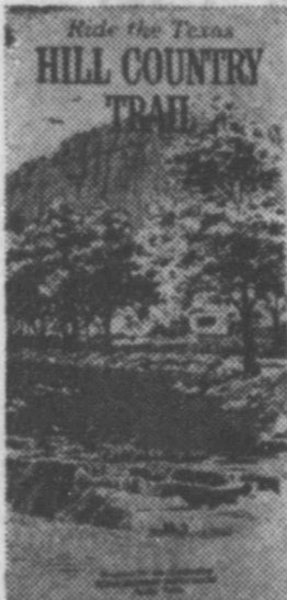
Take the Hill Country Trail and find out whose hair is mohair.