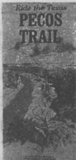
Send for the Pecos Trail folder and you'll know where to sand-surf.