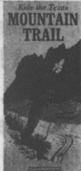
On the Mountain Trail you can see a county bigger than Connecticut.