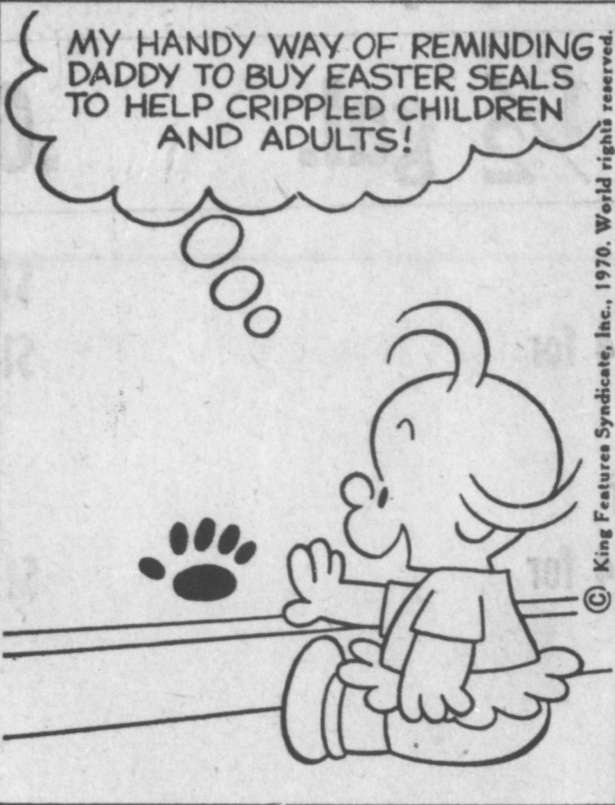
© King Features Syndicate, Inc., 1970. World rights reserved.