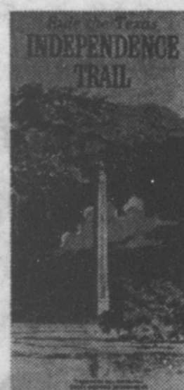
On the Independence Trail you'll see the only oceanarium between the Pacific and the Atlantic.