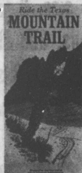
On the Mountain Trail you can see a county bigger than Connecticut.