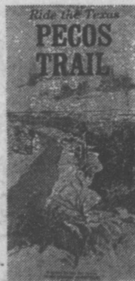
Send for the Pecos Trail folder and you'll know where to sand-surf.

Texas Tourist Development Agency Box TT, Capitol Station Austin, Texas 78711