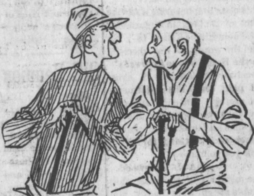
"If I had'er to do over again I'd start me a savin's account at the

NOTICE—Any erroneous reflection upon the character, standing or reputation of any person, firm or corporation which may appear in the columns of The Informer will gladly be corrected upon its being brought to the attention of the publisher.