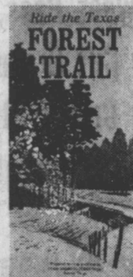
On the Forest Trail you can take the shortest railroad ride in the country.