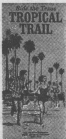
Take the Tropical Trail and maybe you'll catch a glimpse of the near-extinct whooping crane.