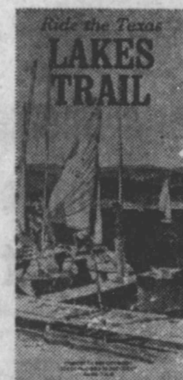
Follow the Lakes Trail and discover what "First Mondays" are and what you can swap there.