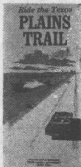
Take the Plains Trail and you'll see a canyon over 100 miles long.

Trail folders. These folders include detailed maps prepared by the Texas Highway Department and descriptive notes on things and places you never knew existed in Texas! land of contrast.