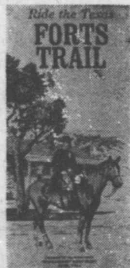
Follow the Forts Trail and you can dine at a restaurant that serves buffalo steaks.