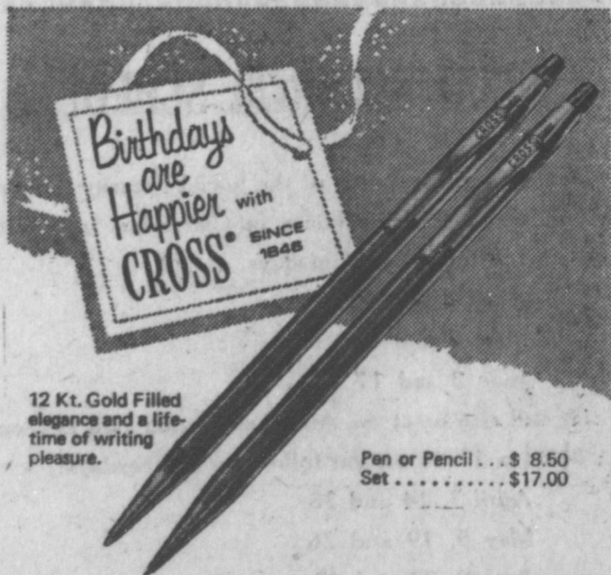
12 Kt. Gold Filled elegance and a lifetime of writing pleasure.

Pen or Pencil . . . $ 8.50 Set . . . . . $17.00