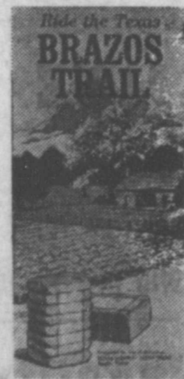
The Brazos Trail tells you where to take Sunday afternoon rides in a surrey.