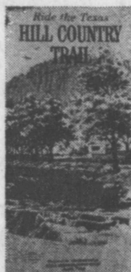
Take the Hill Country Trail and find out whose hair is mohair.