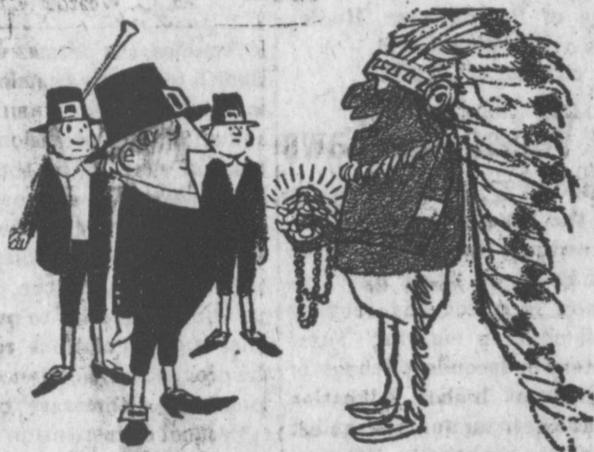
"Now I can start-um regular savings at

NOTICE—Any erroneous reflection upon the character, standing or reputation of any person, firm or corporation which may appear in the columns of The Informer will gladly be corrected upon its being brought to the attention of the publisher.