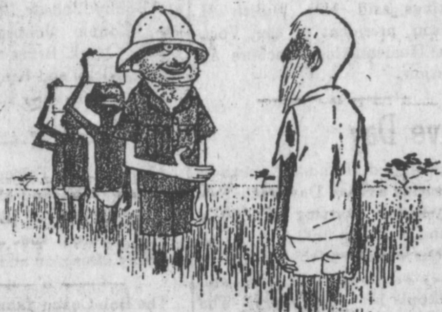
"Dr. Livingston, I presume you bank by mail at

NOTICE—Any erroneous reflection upon the character, standing or reputation of any person, firm or corporation which may appear in the columns of The Informer will gladly be corrected upon its being brought to the attention of the publisher.