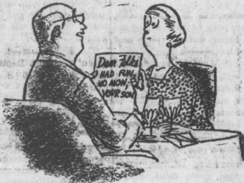
"Well, Junior is still biting the books... my check book, that is."

NOTICE—Any erroneous reflection upon the character, standing or reputation of any person, firm or corporation which may appear in the columns of The Informer will gladly be corrected upon its being brought to the attention of the publisher.