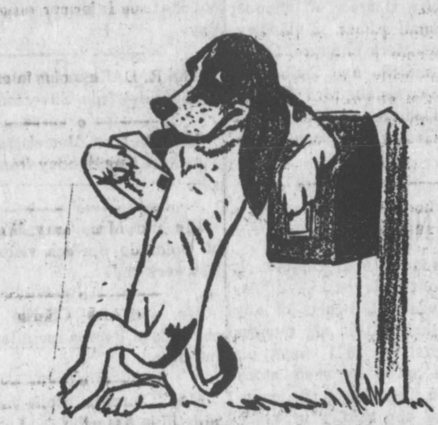
It's so easy anyone can bank by mail.

NOTICE—Any erroneous reflection upon the character, standing or reputation of any person, firm or corporation which may appear in the columns of The Informer will gladly be corrected upon its being brought to the attention of the publisher.