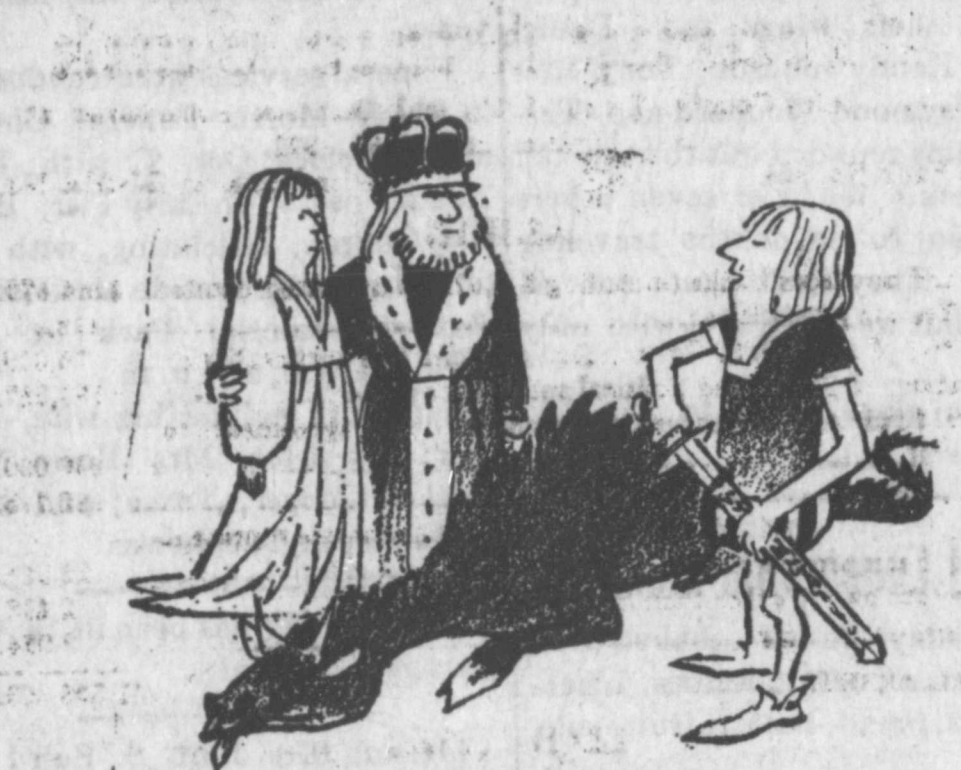
"Never mind your daughter's hand . . . just give me a check from

NOTICE—Any erroneous reflection upon the character, standing or reputation of any person, firm or corporation which may appear in the columns of The Informer will gladly be corrected upon its being brought to the attention of the publisher.