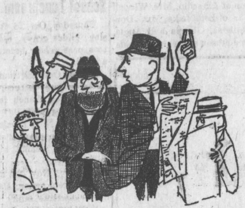
"You're wasting your time, old man. I've got all my money in a checking account at

NOTICE—Any erroneous reflection upon the character, standing or reputation of any person, firm or corporation which may appear in the columns of The Informer will gladly be corrected upon its being brought to the attention of the publisher.