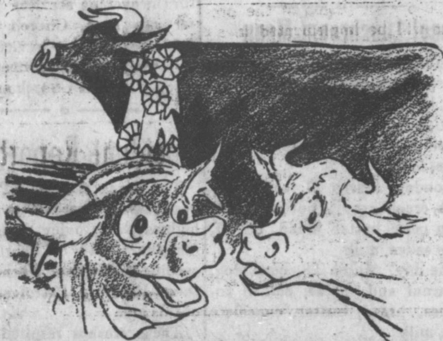
"His registry fills a whole deposit box at the

NOTICE—Any erroneous reflection upon the character, standing or reputation of any person, firm or corporation which may appear in the columns of The Informer will gladly be corrected upon its being brought to the attention of the publisher.