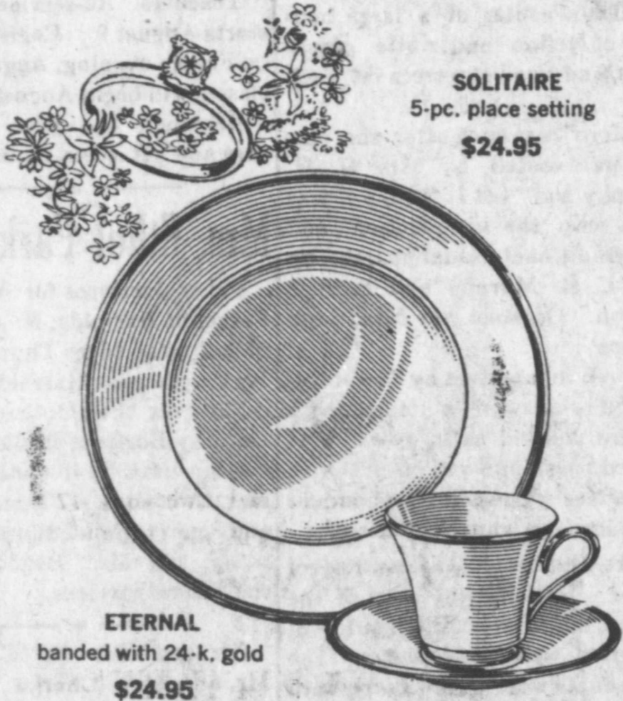
SOLITAIRE 5-pc. place setting $24.95