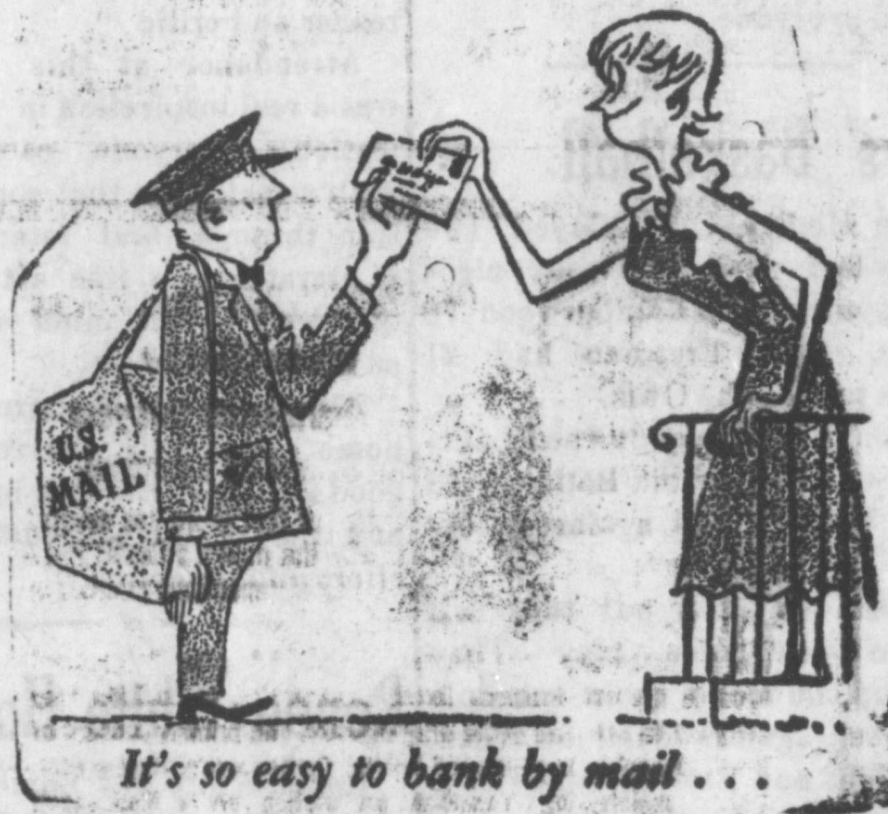
It's so easy to bank by mail...

NOTICE—Any erroneous reflection upon the character, standing or reputation of any person, firm or corporation which may appear in the columns of The Informer will gladly be corrected upon its being brought to the attention of the publisher.