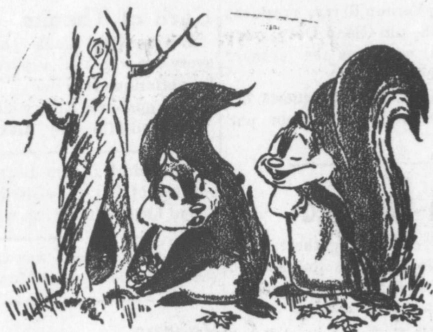
"Nuts! I store my valuables in a safe deposit box at the

NOTICE—Any erroneous reflection upon the character, standing or reputation of any person, firm or corporation which may appear in the columns of The Informer will gladly be corrected upon its being brought to the attention of the publisher.