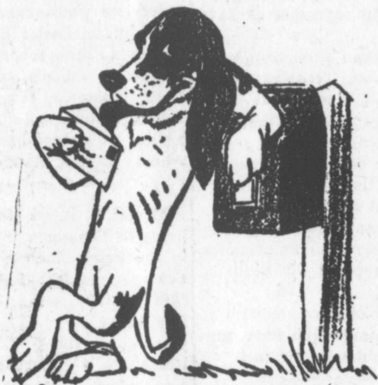
It's so easy anyone can bank by mail.

NOTICE—Any erroneous reflection upon the character, standing or reputation of any person, firm or corporation which may appear in the columns of The Informer will gladly be corrected upon its being brought to the attention of the publisher.