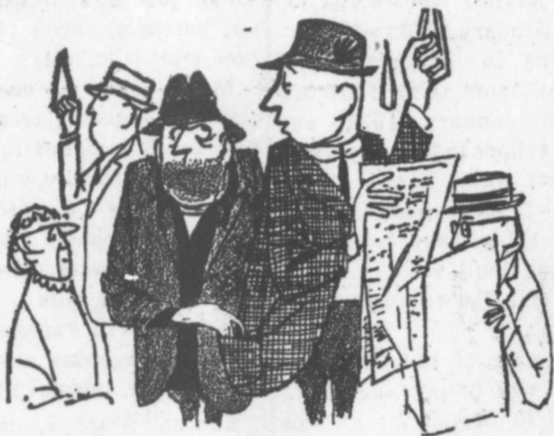
"You're wasting your time, old man. I've got all my money in a checking account at

NOTICE—Any erroneous reflection upon the character, standing or reputation of any person, firm or corporation which may appear in the columns of The Informer will gladly be corrected upon its being brought to the attention of the publisher.