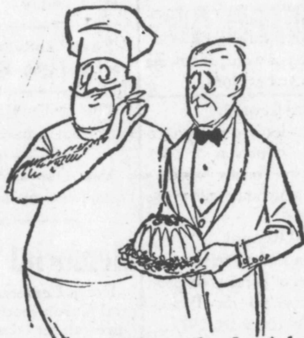
"I keep the recipe in a safety deposit box at the"

NOTICE—Any erroneous reflection upon the character, standing or reputation of any person, firm or corporation which may appear in the columns of The Informer will gladly be corrected upon its being brought to the attention of the publisher.