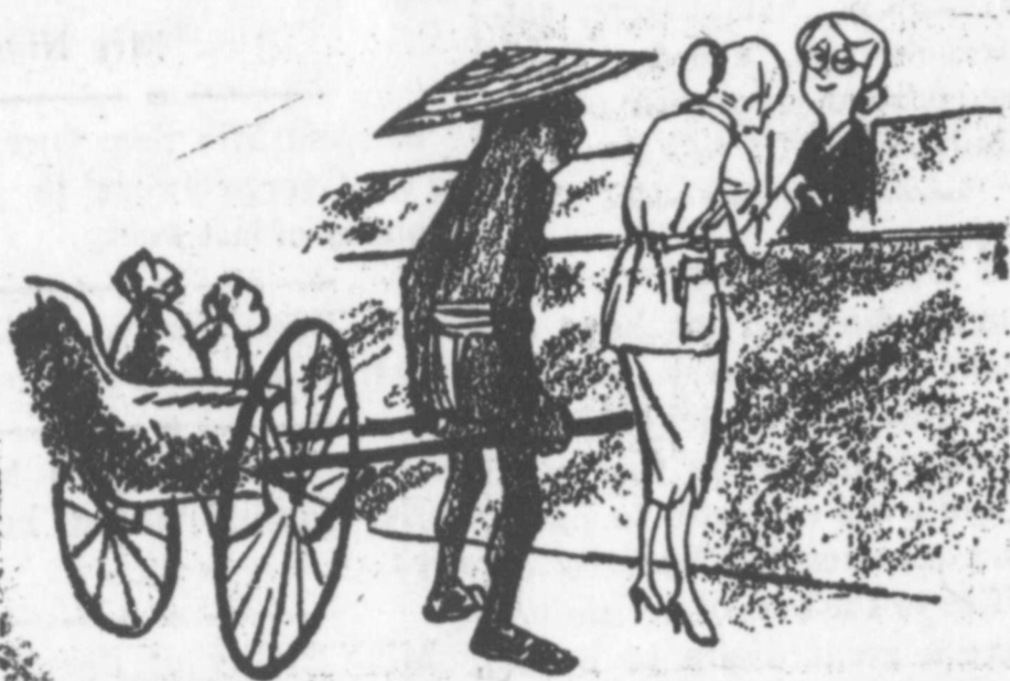
Folks come from all over to save at the

NOTICE —Any erroneous reflection upon the character, standing or reputation of any person, firm or corporation which may appear in the columns of The Informer will gladly be corrected upon its being brought to the attention of the publisher.