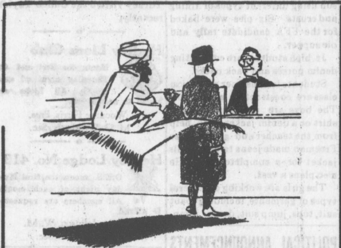
Folks come from all over to save at the

NOTICE—Any erroneous reflection upon the character, standing or reputation of any person, firm or corporation which may appear in the columns of The Informer will gladly be corrected upon its being brought to the attention of the publisher.