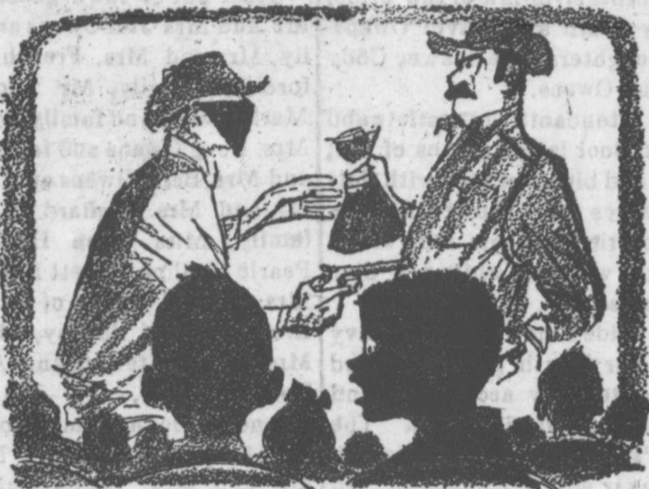
"I told ya he shoul'da kept it in the"

NOTICE —Any erroneous reflection upon the character, standing or reputation of any person, firm or corporation which may appear in the columns of The Informer will gladly be corrected upon its being brought to the attention of the publisher.