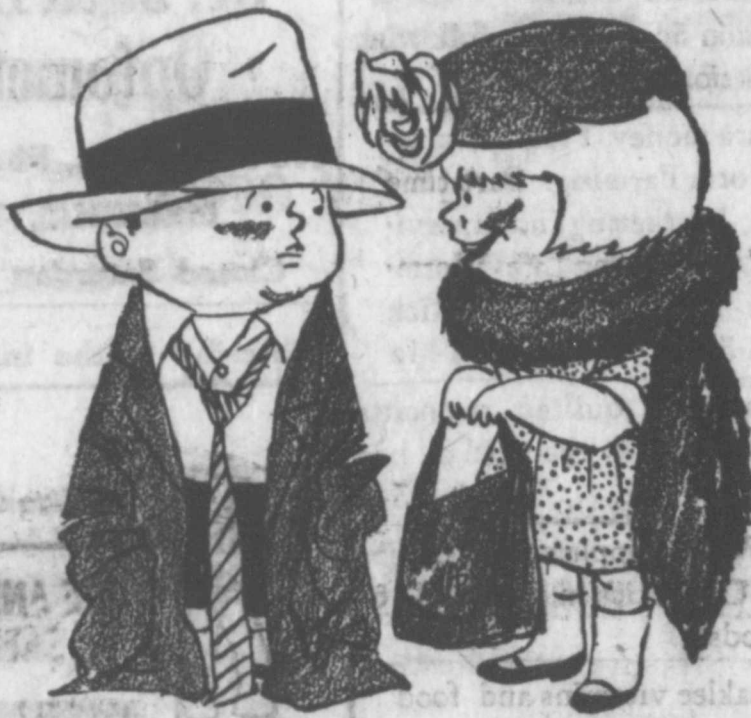
"... Now let's open a joint account at

Published every Friday at Hedley, Texas except on special days after October 28, 1930, at the post office at Hedley, Texas under the Act of March 3, 1879, by one of ways to legal as other advertising the publisher does not accept liability for damages in excess of the amount received for the circulation. Resolutions of respect, cards of thanks, advertise- ments of social functions, when admission charged, will be accepted as advertising and charged for accordingly. Any erroneous reflection upon the character, stand- ing or reputation of any person, firm or corporation which may appear in the columns of The Informer will gladly be corrected upon its being brought to the attention of the publisher.