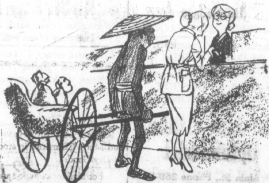
Folks come from all over to save at the

NOTICE —Any erroneous reflection upon the character, standing or reputation of any person, firm or corporation which may appear in the columns of The Informer will gladly be corrected upon its being brought to the attention of the publisher.