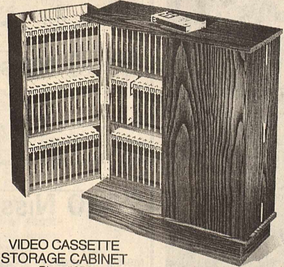
VIDEO CASSETTE STORAGE CABINET Plan #870

Even a modest collection of video cassette tapes can become an unsightly jumble of cardboard containers stacked on top of the television, the video cassette recorder or the floor. This smart little cabinet has storage capacity for up to 144 VHS size cassettes. A magnetic touch-latch eliminates the need for door pulls, giving the cabinet a clean, unobtrusive appearance. Veneer plywood or solid wood panels can be used for construction. Dimensions are 30" high, 30" wide and 11-1/4" deep. (#870...$7.95 plus $2.50 shipping charge).