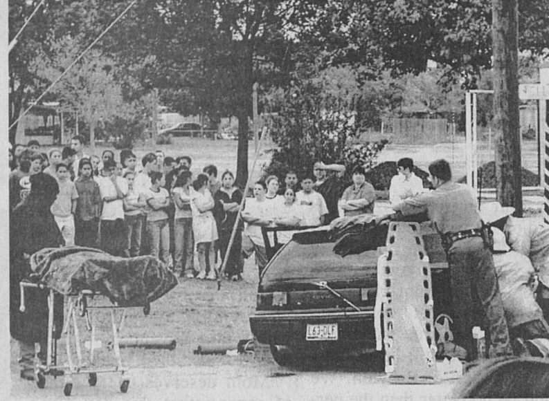
High School and Junior High students look on as local law enforcement and emergency services work a mock accident near the school Monday morning.

mock accident put on by local law enforcement, emergency and governmental agencies as part of the "Shattered Dreams" program.