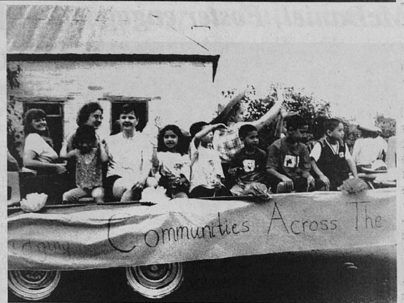
One of the many floats participating in this years Cinco de Mayo parade last Saturday.

LAS MORAS MASONIC LODGE meets the 2nd Tuesday, at 7:00 p.m. Lamar Medal presentation May 16th, 7:00 p.m. at Las Moras Lodge Past Masters May 18th, 6:00 p.m. Slator Hall Visiting Brothers are Welcome