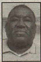
St. John's Missionary Church

Then was brought unto him one possessed with a devil, blind and dumb, and he healed him,