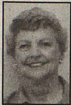
Goodies From G.G.

In small bowl, combine oil, egg and milk; set aside. Crumble bacon; set aside. In large bowl, combine flour, sugar and baking powder. Make well in center, add egg mixture all at once to flour mixture, stirring just until moistened. Batter should be