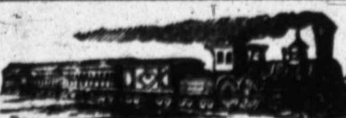
"The Wichita Falls Route"