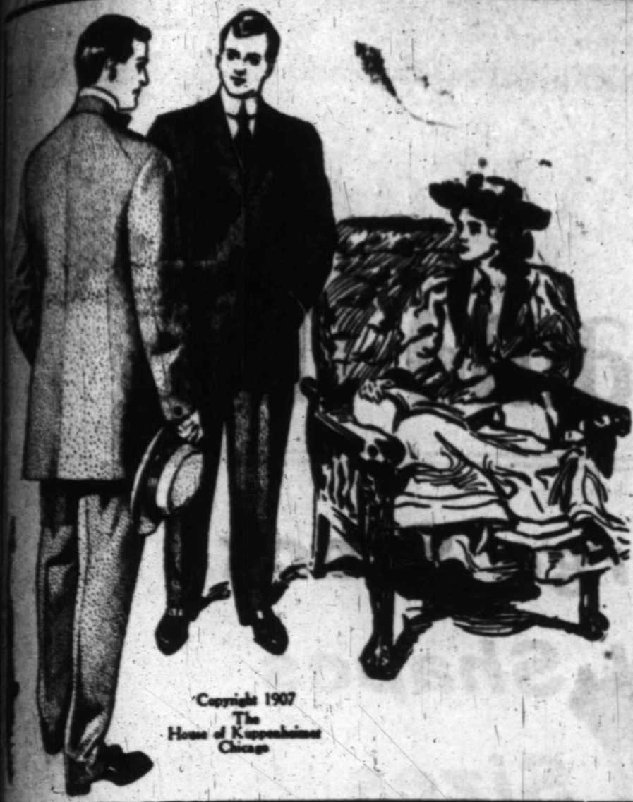
Copyright 1907 The House of Kuppenheimer Chicago