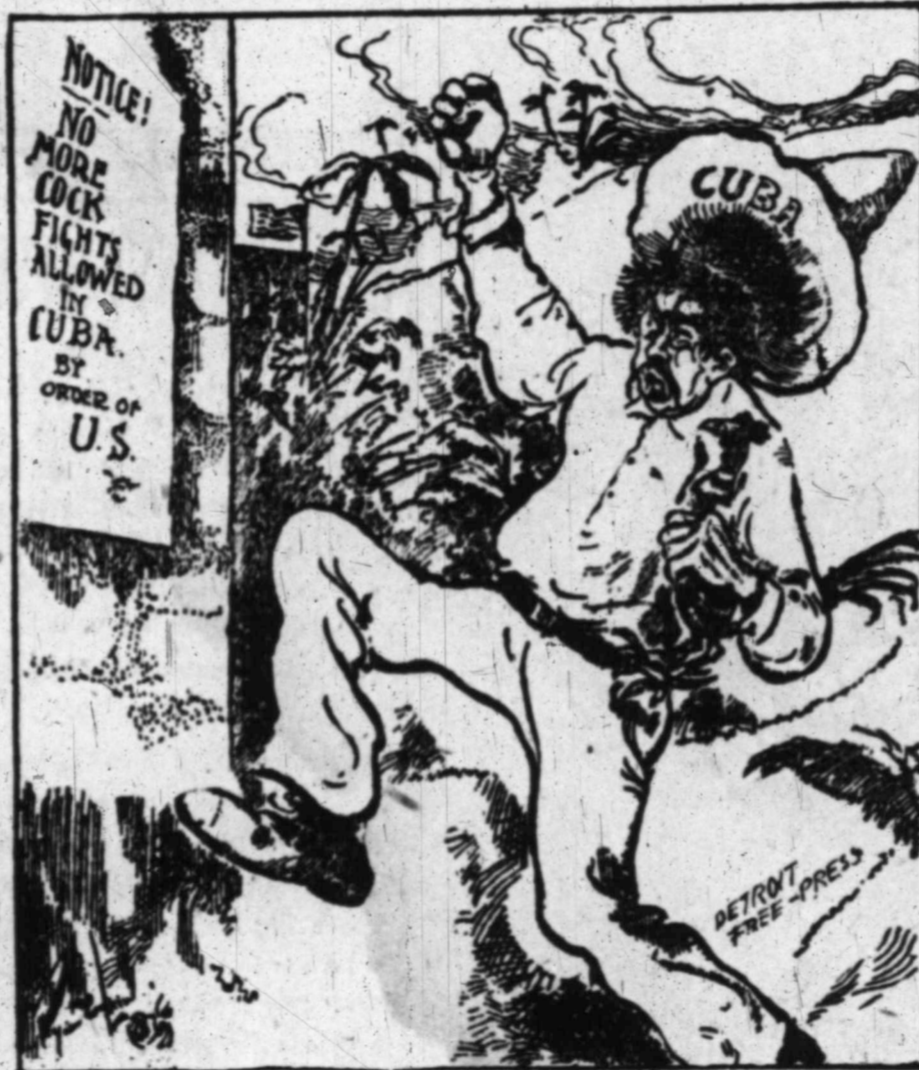
The Patriot—"Cuba Libre! This United States Intervention Business is the One Grand Failure!"