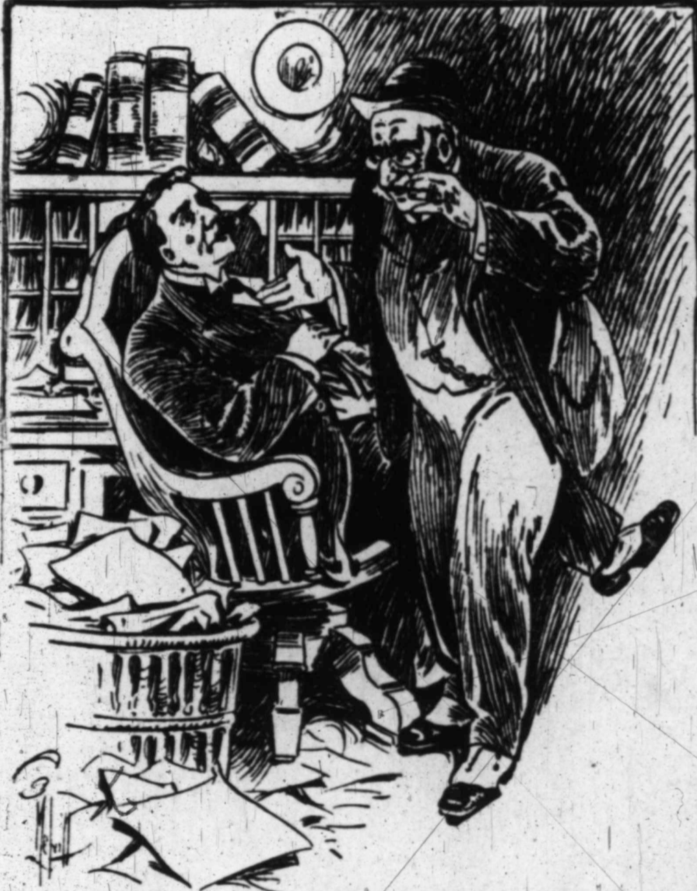
"To-Morrow's Friday der T'irteenth."

Thursday, November 12, was a memorable day in Wall street. As the gong pealed its the-games-closed-till-another-day, the myriad of tortured souls that are supposed to haunt the treacherous bogs and quicksands of the great exchange, where lie their earthly hopes, must have prayed with renewed earnestness for its destruction before the morrow. Never had the stock exchange folded its tents with surer confidence of continuing its victorious march. Sugar advanced with record-breaking total sales to 207 1/2 and the final half-hour carried the whole list of stocks up with it. In