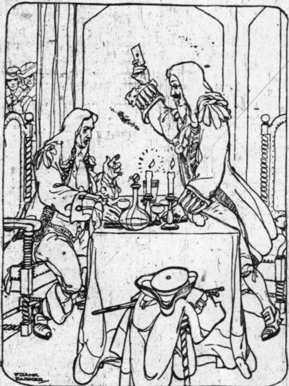
"MERCI, M. LE DUC!" HE LAUGHED.

"You scurvy footboy, you greasy barber, you cutthroat groom"—