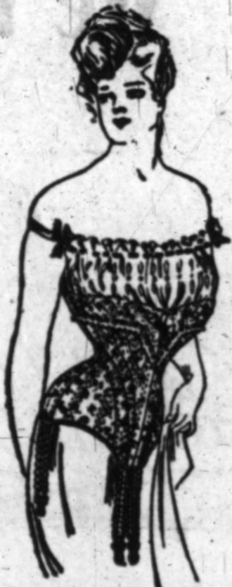
AMERICAN BEAUTY STYLE 700 Kalamazoo Corset Co., Makers