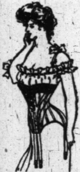
AMERICAN BEAUTY Style 634 Kalamazoo Corset Co., Makers