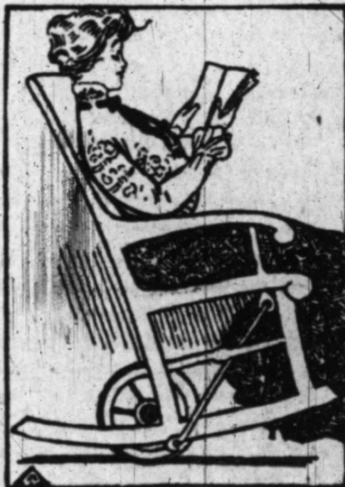
ROCKER AND WHEELING CHAIR.

To instantly change a rocking chair into a wheeling or invalid chair is made possible by the recent invention of a California man. An ordinary rocker is employed, a pair of rubber tired wheels being journaled close to