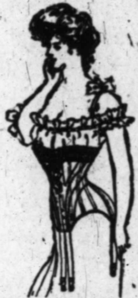
AMERICAN BEAUTY Style 906 Kalamazoo Corset Co., Makers