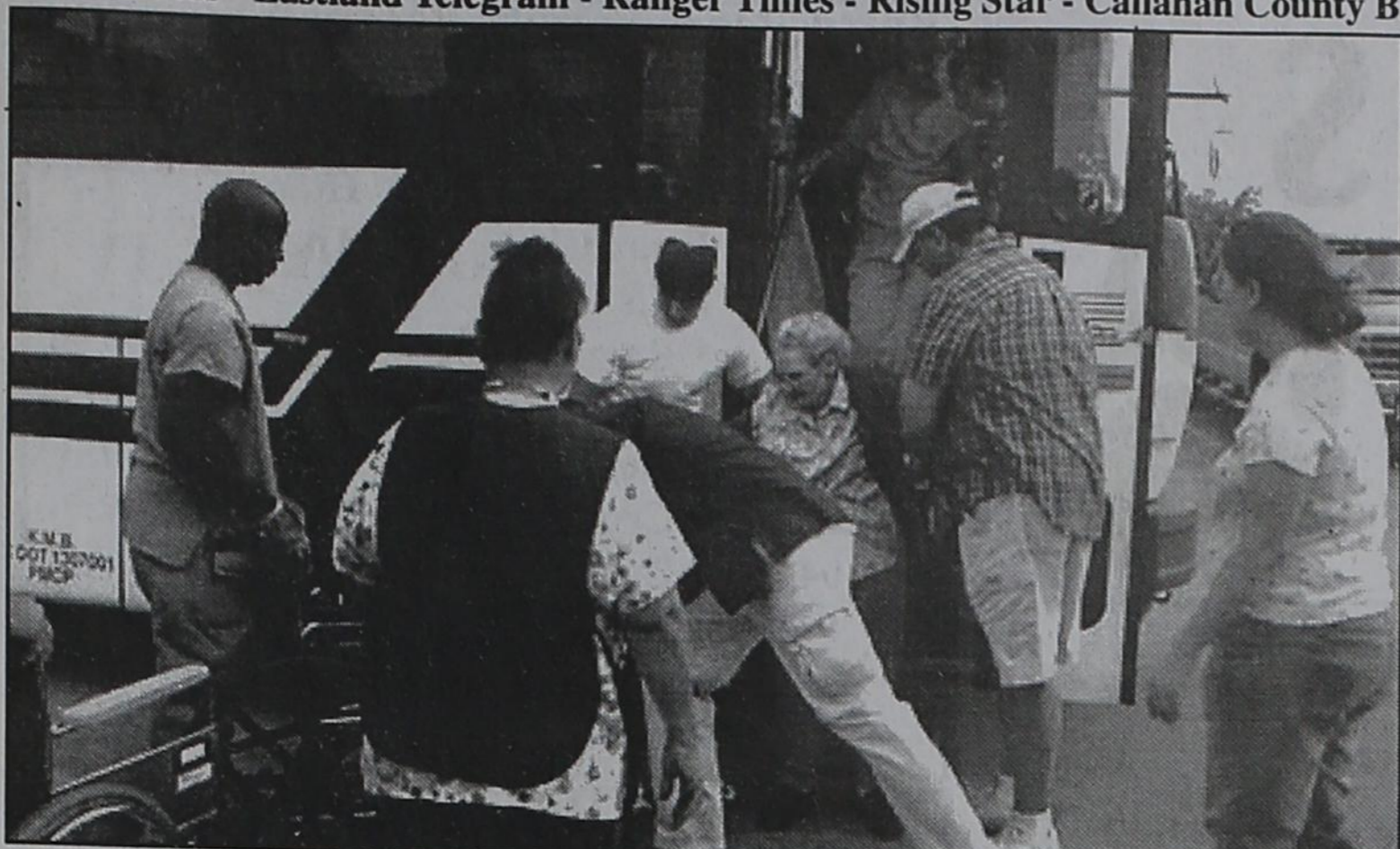
Pyramid HealthCare staff unloading residents.