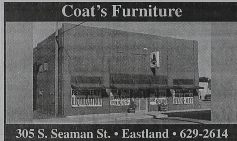
305 S. Seaman St. • Eastland • 629-2614