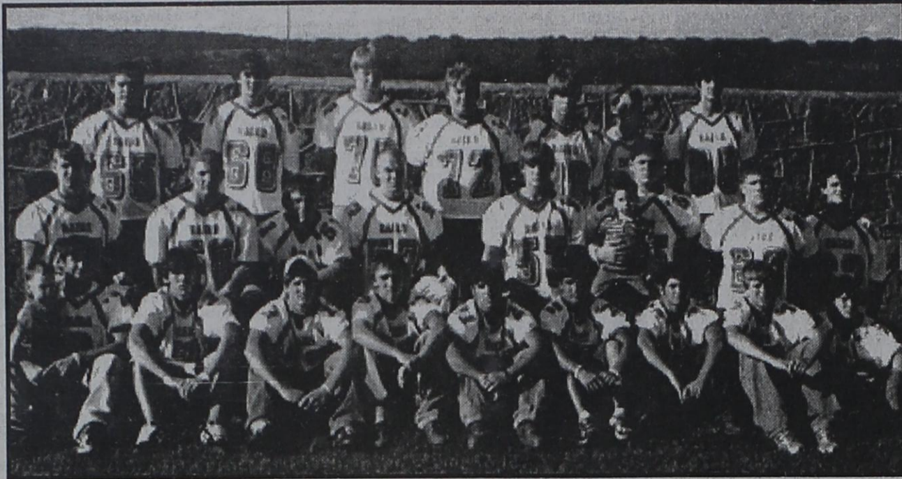
BAIRD BEARS Varsity Football Team