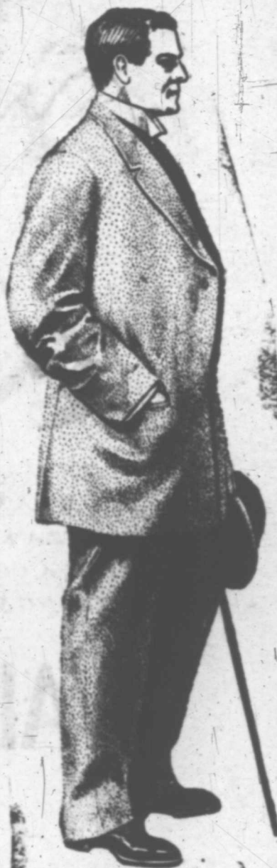
Copyright 1907 The House of Kuppenheimer Chicago