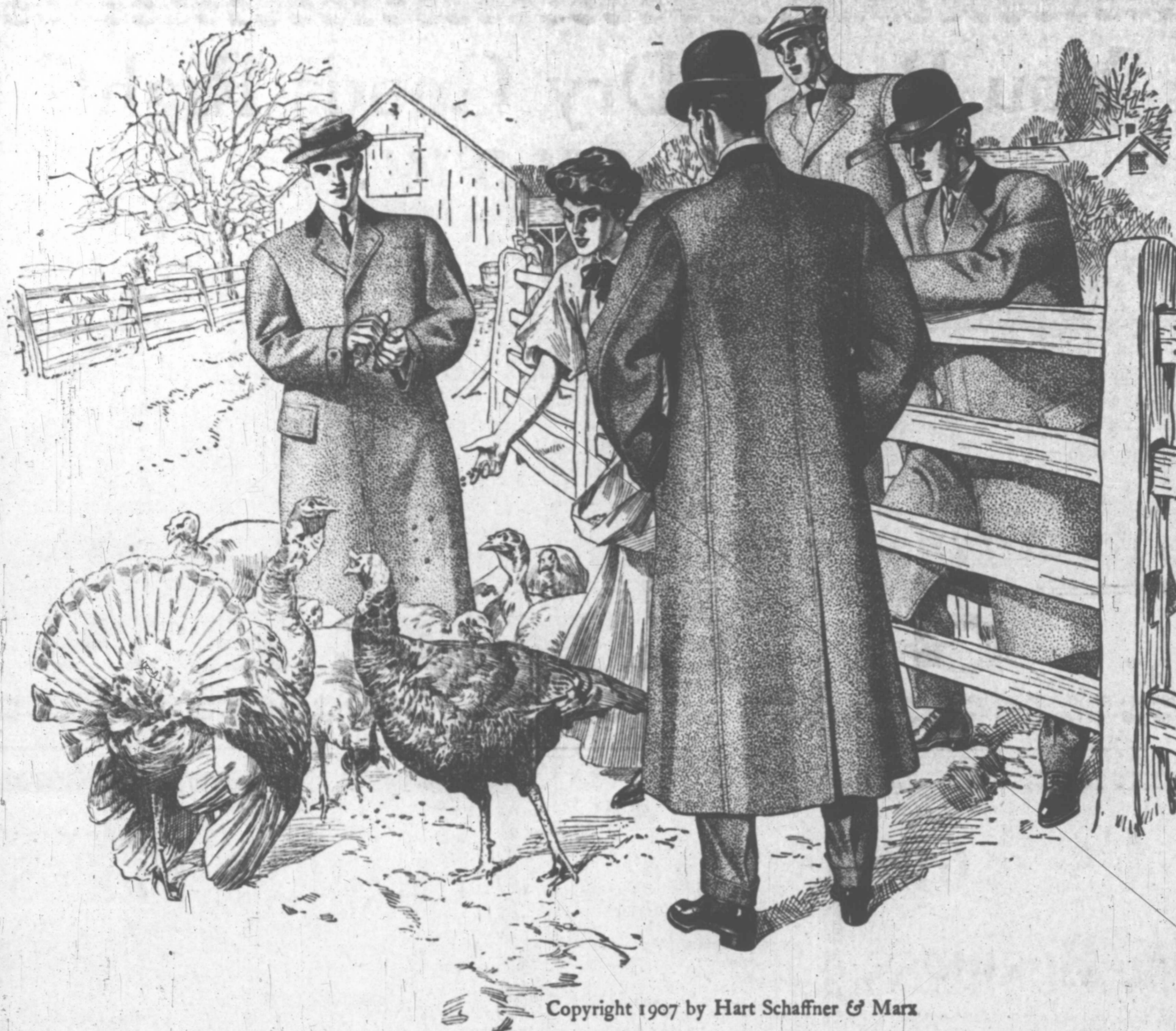
Copyright 1907 by Hart Schaffner & Marx