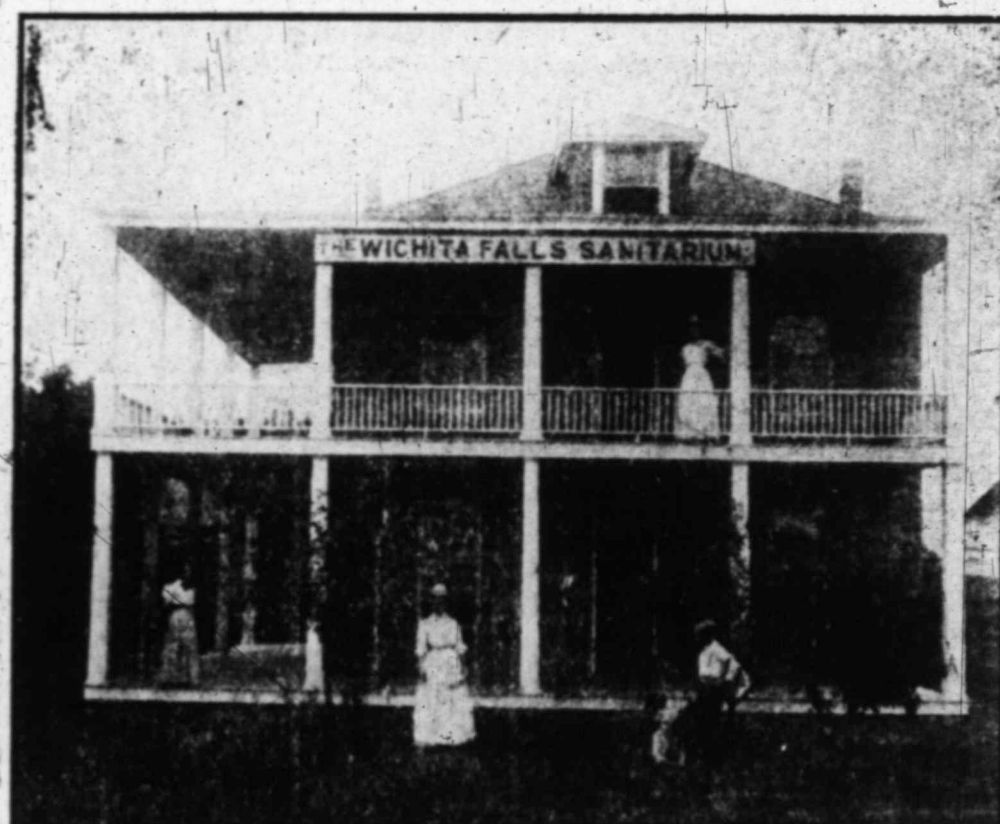
THE WICHITA FALLS SANITARIUM A modern, up-to-date institution for treatment of Medical and Surgical Diseases. Trained nurses in attendance. Corner 7th St. and Scott Ave.

The Cream Bakery wants to sell you your Christmas candies, nuts and fruits. Their line is complete. 176-1f