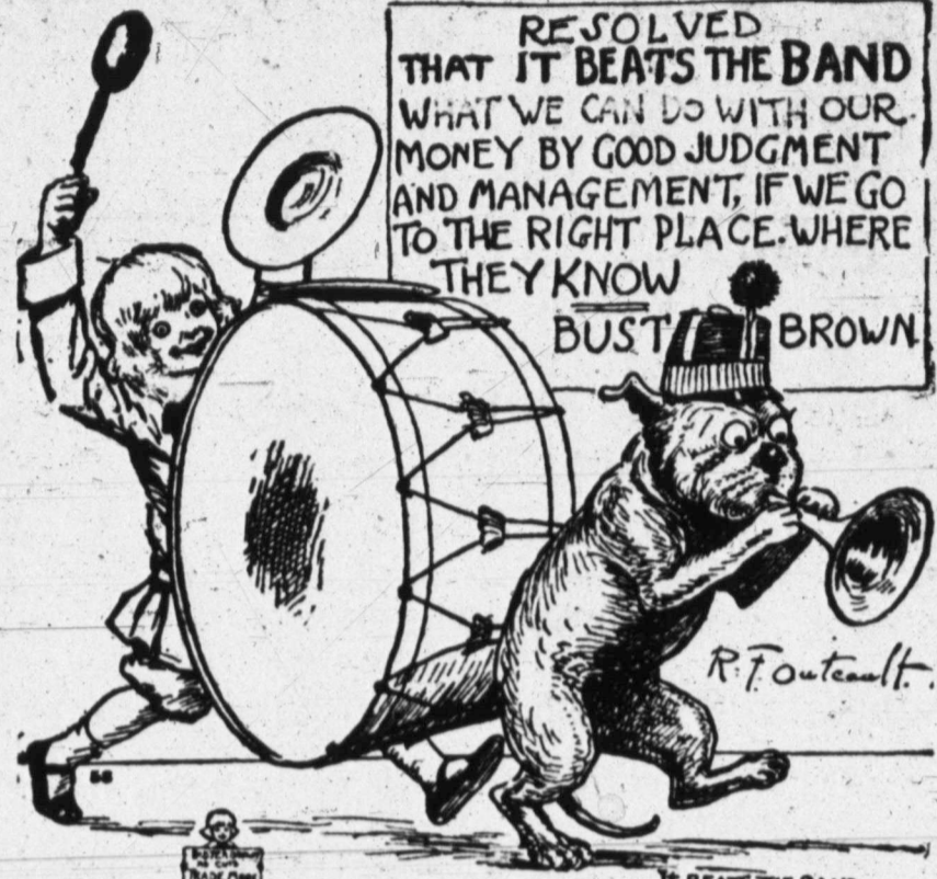
COPYRIGHT 1906 BY THE BUSTER BROWN CO. CHICAGO.