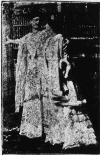
Scene From Act Two

Played 287 Times to 281,211 paid admissions at the Criterion Theatre, N. Y. City.