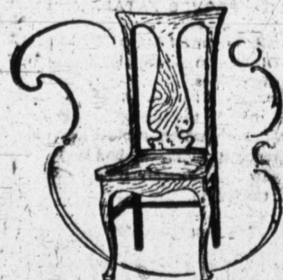
All Quartered with Cobble Seat.

We want to show you our stock of Furniture and House Furnishing and quote you prices. We can save you more than one-fourth as compared with other houses.