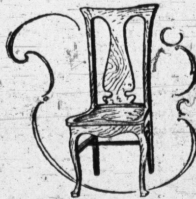
All Quarters with Cobbler Seat.

We want to show you our stock of Furniture and House Furnishing and quote you prices. We can save you more than one-fourth as compared with other houses.