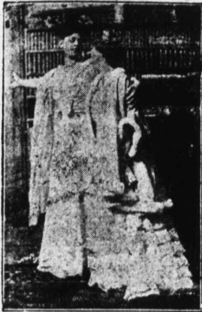
Scene From Act Two

Played 287 Times to 281,211 paid admissions at the Criterion Theatre, N. Y. City.