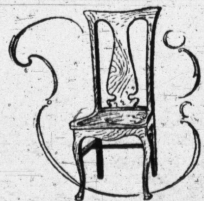
All Quartered with Cobbler Seat.