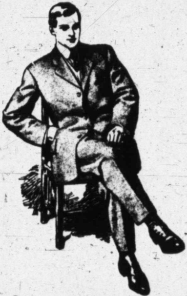
Copyright 1907 The House of Knickerbocker Chicago

The hundreds of our customers who have bought bargains from us during this sale are doing advertising for us with all their friends. No one can afford to let such a golden opportunity pass by. It will pay you to leave all your work and come in to this Bargain Event.