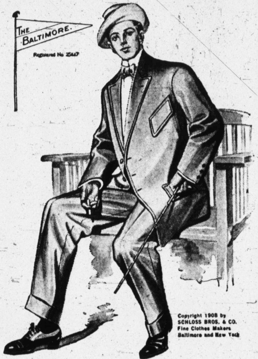
Copyright 1908 by SCHLOSS BROS. & CO. Fine Clothes Makers Baltimore and New York

All the latest shades and colorings here--new Greys, Olives, Browns, Blues and the fancy "Elephant" tones--in smart mixtures, plaids and pencil-stripes. Come in and see these beautiful suits--special offerings at $15, $18 and $20