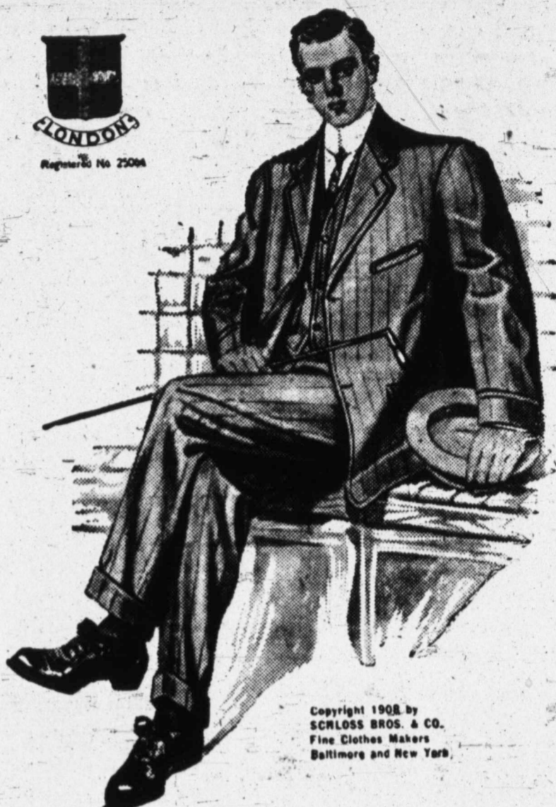
Copyright 1908 by SCHLOSS BROS. & CO. Fine Clothes Makers Baltimore and New York