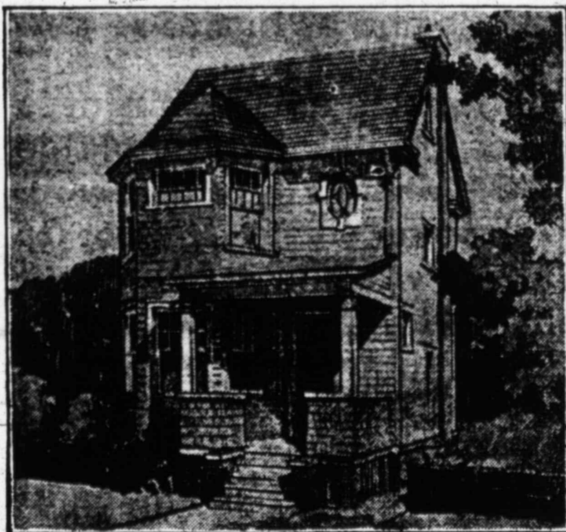
PERSPECTIVE VIEW—FROM A PHOTOGRAPH.