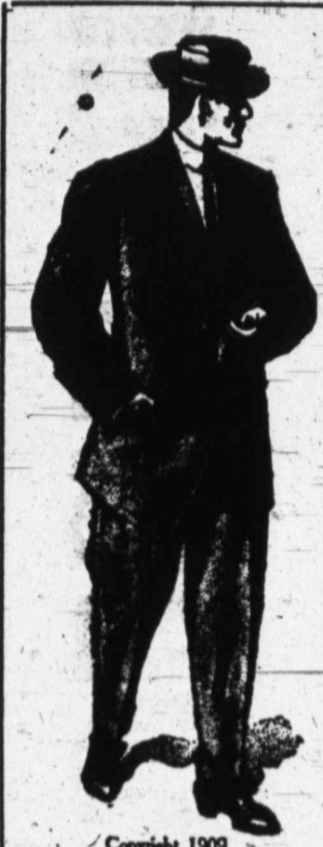
Copyright 1909 The House of Kuppenheimer Chicago

Have you ever worn a suit the coat of which puckered up like a frosted persimmon within a short time? It Wasn't a Kuppenheimer Suit