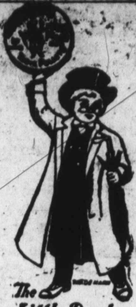
The Little Doctor