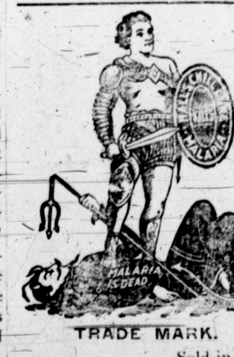
TRADE MARK. Sold in Nacogdoches by The Weeks Drug Co.