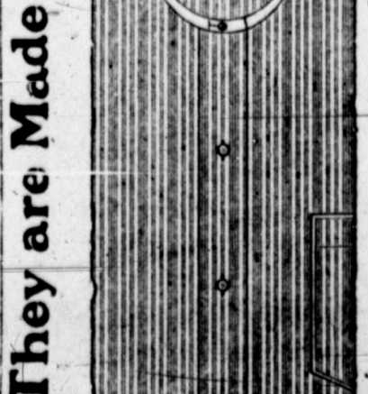
Try a half dozen-More or