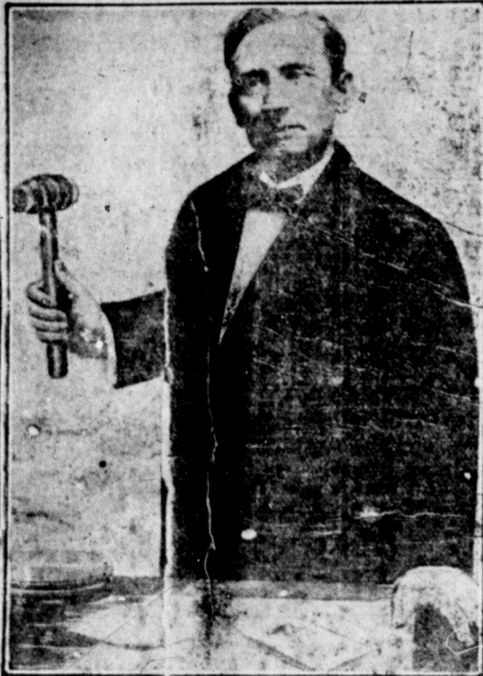
Hon. Will H. Mayes, Lieutenant-Governor, who is presiding over the Upper House of the Thirty-third Legislature of Texas.